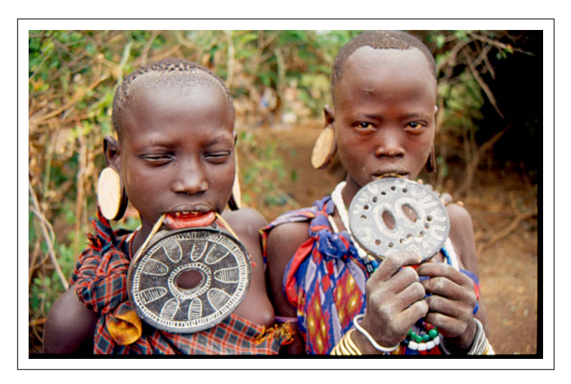
Figure 3. Young Mursi girls fasten lip-plates to their lower teeth.

baskets and pots, machete and fake calf<sup>10</sup> on the head of women. When I asked Mursi women why they put these materials on, they explained that they would not be photographed without these things. The appearance of a Mursi woman in front of the tourist camera (see a typical example in Figure 4) was the result of the cultural logic that the Mursi constructed in response to the tourists' expectations. These objects were la per-ruque : camouflage of economic tactics, where trickery gives possibility for the socially weak to deploy their force against affluent communities. The Mursi tactically use the magical force that their visitors impute on their imaginary self. The socially weak employ and mobilise the mysterious power that Western tourists attribute to the Mursi. The 'well known truth', which Malinowski once noted and Taussig (1991) dusted, is still valid: