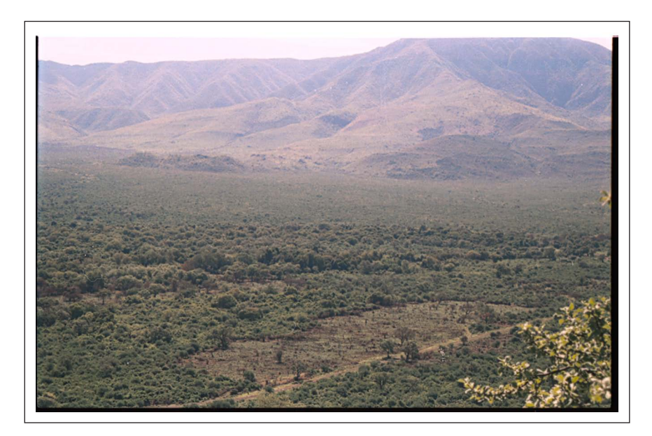
Figure 2. Solbu, a nomad settlement along the road.

Solbu is a spot along the dusty sand road between Jinka and Hana (Figure 2), where the Mursi have established a settlement for their everyday encounters with tourists, a