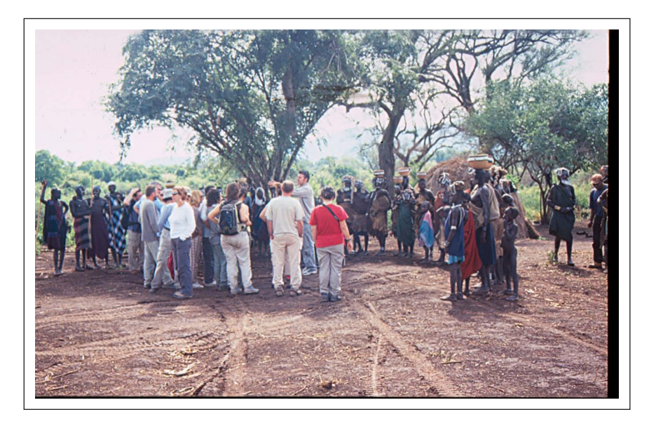
Figure 5. Mursi line up for tourists.

The third method of raising the attention of tourists was where married women or older widows sat in front of a hut and cried out, inviting nearby tourists to take their picture. Modes of gaining attention were varied. People tried to communicate with tourists by hand clapping, screaming or whistling, and when tourists looked towards them, they slapped their chests and asked them to take their photograph. Besides the average 'make up' for outsiders, most Mursi women worked, or imitated working activities, for