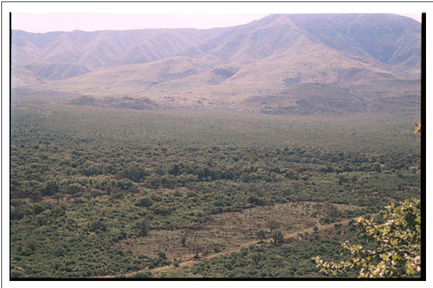
Figure 2. Solbu , a nomad settlement along the road.

Solbu is a spot along the dusty sand road between Jinka and Hana (Figure 2), where the Mursi have established a settlement for their everyday encounters with tourists, a