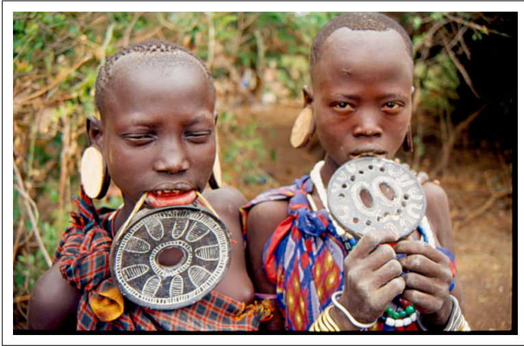
Figure 3. Young Mursi girls fasten lip-plates to their lower teeth.