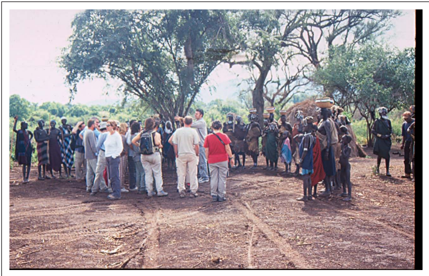
Figure 5. Mursi line up for tourists.

The third method of raising the attention of tourists was where married women or older widows sat in front of a hut and cried out, inviting nearby tourists to take their picture. Modes of gaining attention were varied. People tried to communicate with tourists by hand clapping, screaming or whistling, and when tourists looked towards them, they slapped their chests and asked them to take their photograph. Besides the average 'make up' for outsiders, most Mursi women worked, or imitated working activities, for