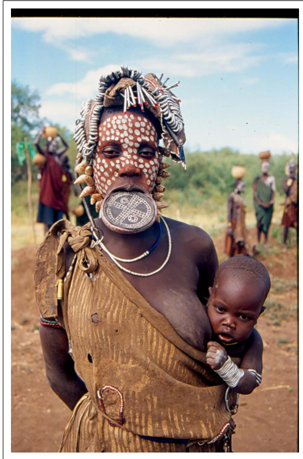
Figure 4. Mursi woman posing for a tourist's camera.