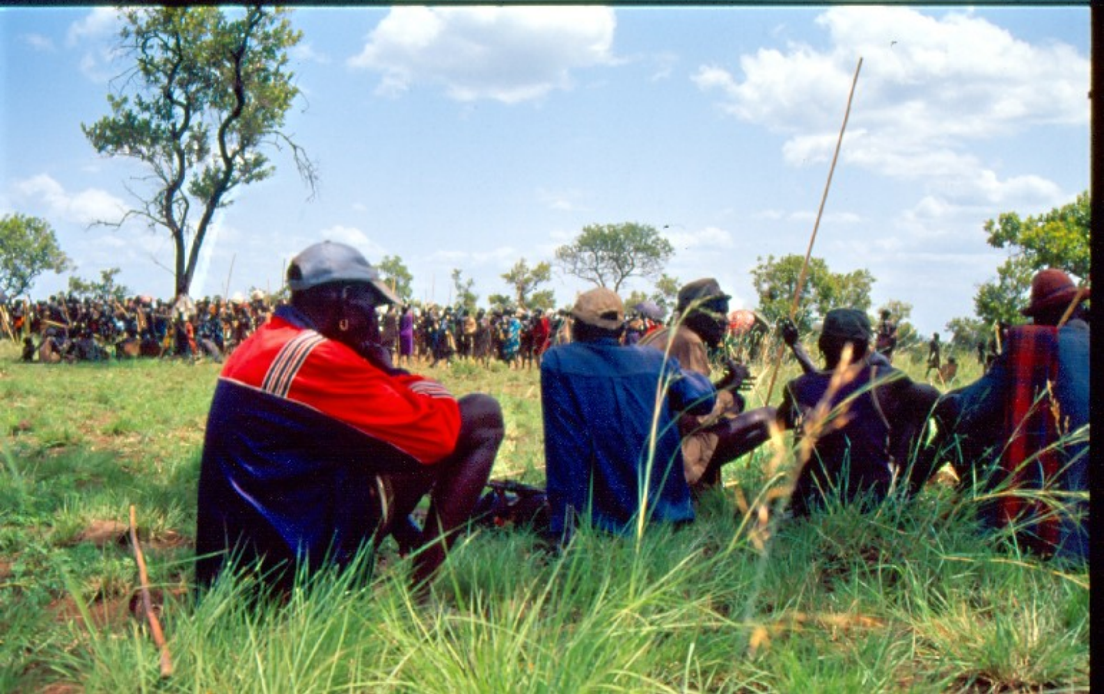
Mi; June, 2008

Elders watching the duelling while talking with each other.