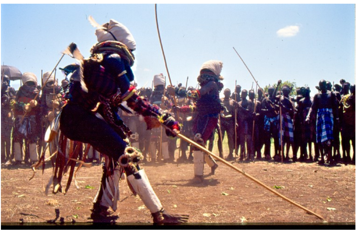
Mi; June, 2008

Contestants surrounded by the spectators - family and clan members, age mates and friends.