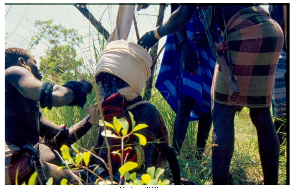
Mi; June, 2008 Putting on the head protection with the help of friends from the same locality and age grade.

The top of the poles, the shape of which is nowadays influenced by the neighbouring Suri.