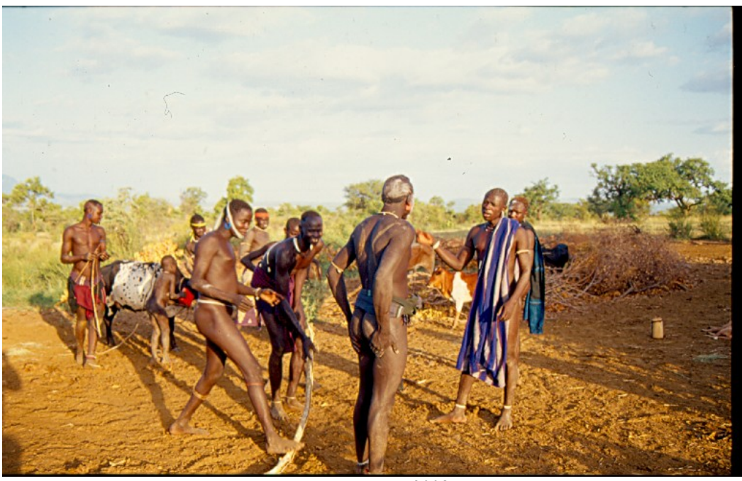
Maganto; June, 2008

A member of the age grade of teenagers, ( Terro ) prepares his duelling pole ( donga ) for the forthcoming contest ( sagine ).