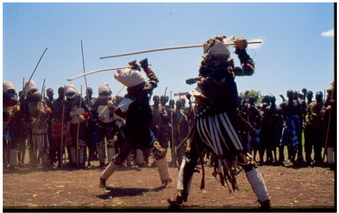
Mi; June, 2008

Contestants surrounded by the spectators - family and clan members, age mates and friends.