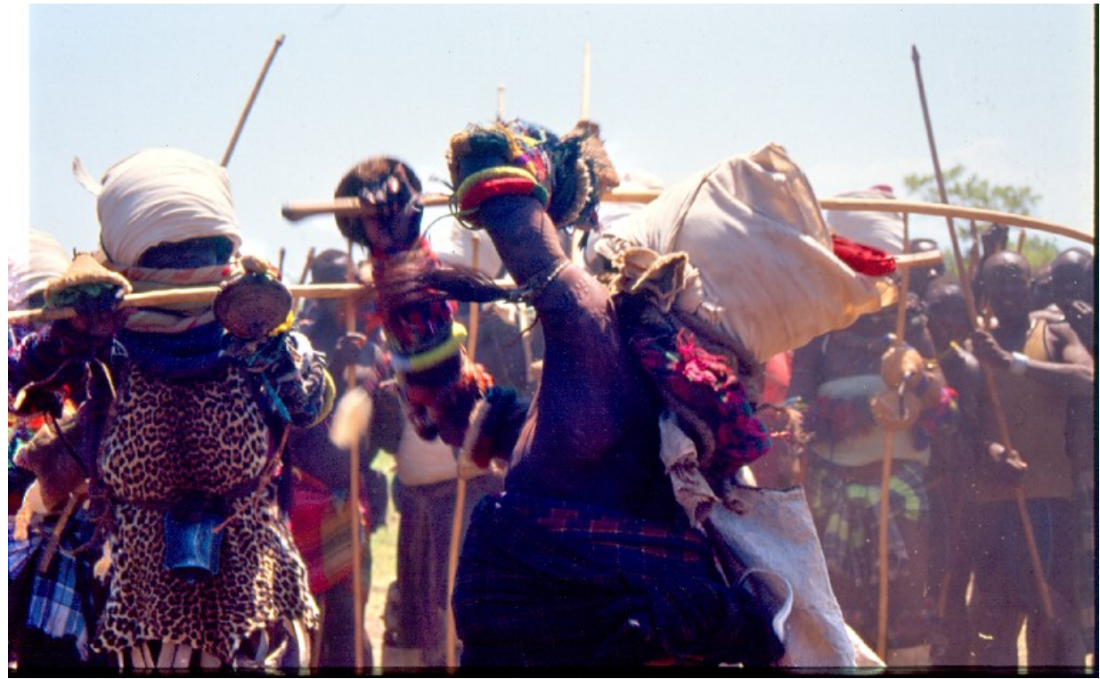
Mi; June, 2008

A contestant wearing a leopard skin, handed down by the previous generation.