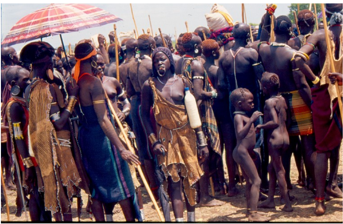
Mi; June, 2008

A duelling contest is a social event, which may last several days, at which people from different parts of the country come together.