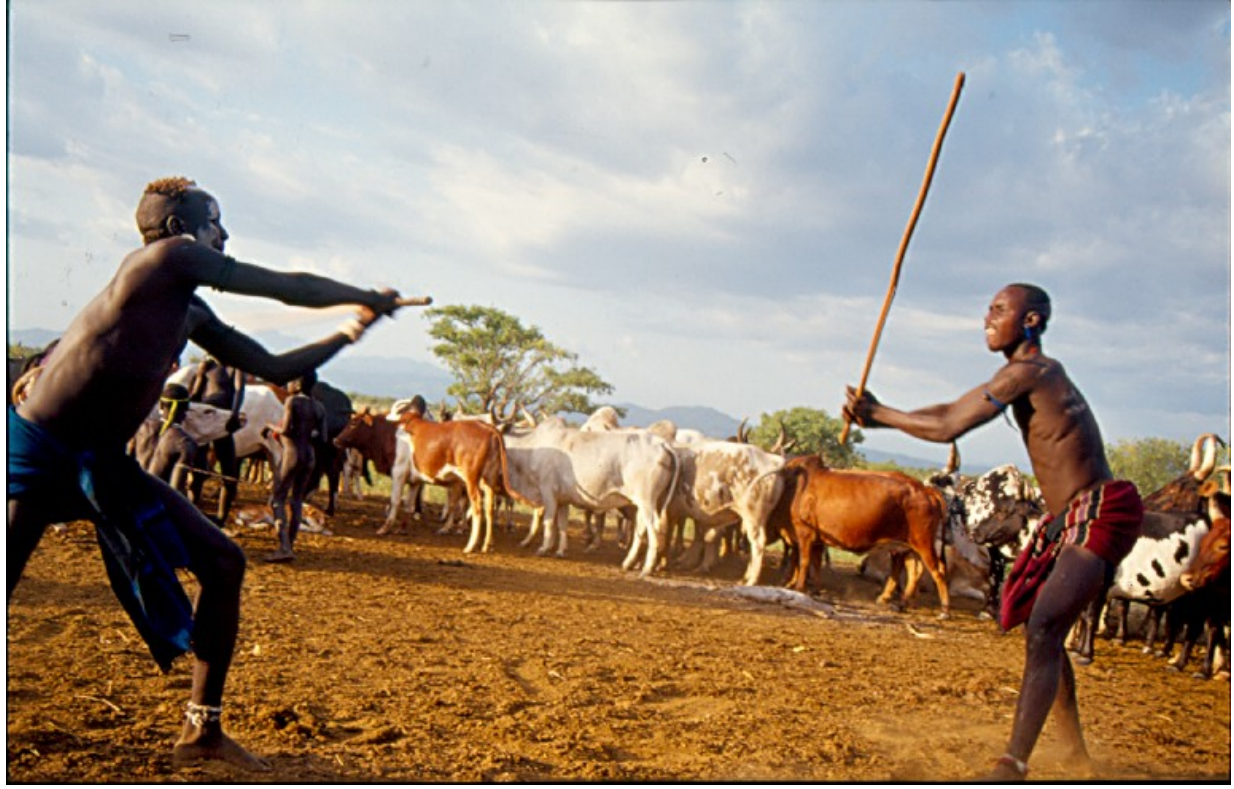
Maganto; June, 2008

The final carving of the pole, with knife and machete ( bangka ).