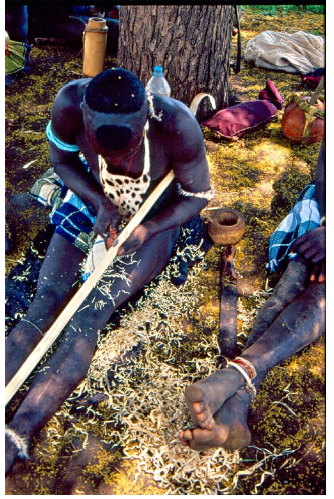
Maganto; June, 2008

The final carving of the pole, with knife and machete ( bangka ).